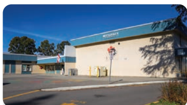
MCCLOSKEY ELEMENTARY School Population: 350