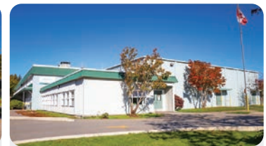
CLIFF DRIVE ELEMENTARY School Population: 300