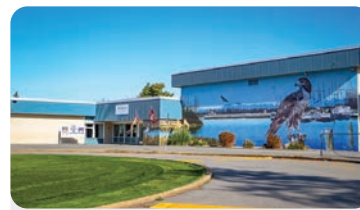
HAWTHORNE ELEMENTARY School Population: 450