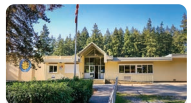
SUNSHINE HILLS ELEMENTARY School Population: 500