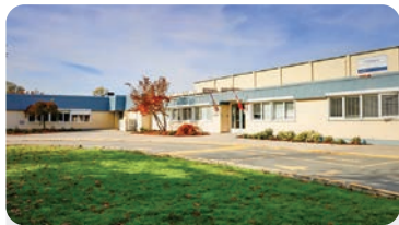
CHALMERS ELEMENTARY School Population: 475