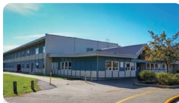
LADNER ELEMENTARY School Population: 450