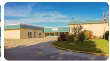
HOLLY ELEMENTARY School Population: 350