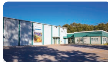
BEACH GROVE ELEMENTARY School Population: 300