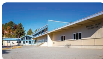
ENGLISH BLUFF ELEMENTARY School Population: 200