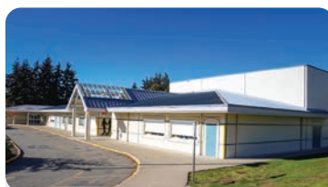
RICHARDSON ELEMENTARY School Population: 400