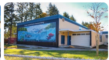
SOUTH PARK ELEMENTARY School Population: 400