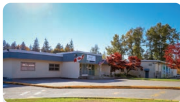
HEATH ELEMENTARY School Population: 225