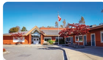
NEILSON GROVE ELEMENTARY School Population: 175