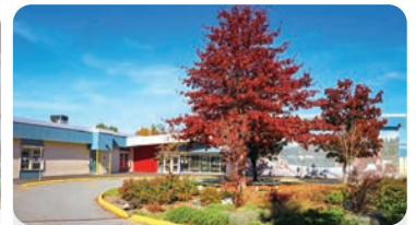
GIBSON ELEMENTARY School Population: 400