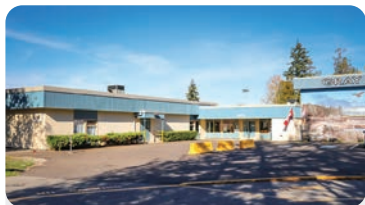
GRAY ELEMENTARY School Population: 500