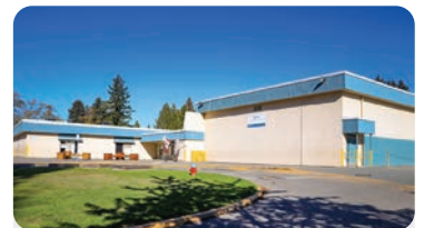
JARVIS ELEMENTARY School Population: 450