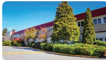
DEVON GARDENS ELEMENTARY School Population: 350