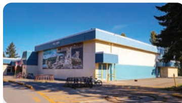
HELLINGS ELEMENTARY School Population: 300