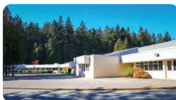
PINEWOOD ELEMENTARY School Population: 300