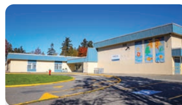
PEBBLE HILL ELEMENTARY School Population: 250