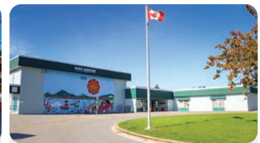
PORT GUICHON ELEMENTARY School Population: 175