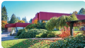
COUGAR CANYON ELEMENTARY School Population: 500